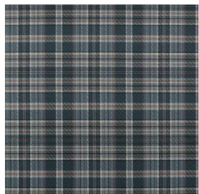
Regan Indigo print fabric