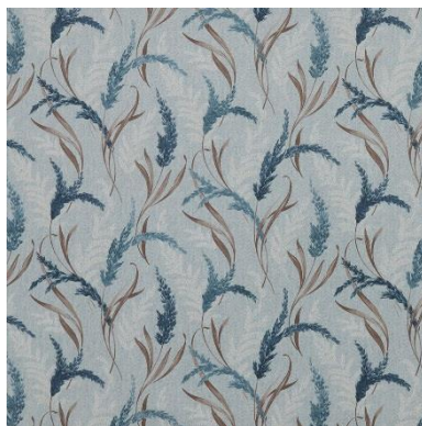
Susanna Sky print fabric